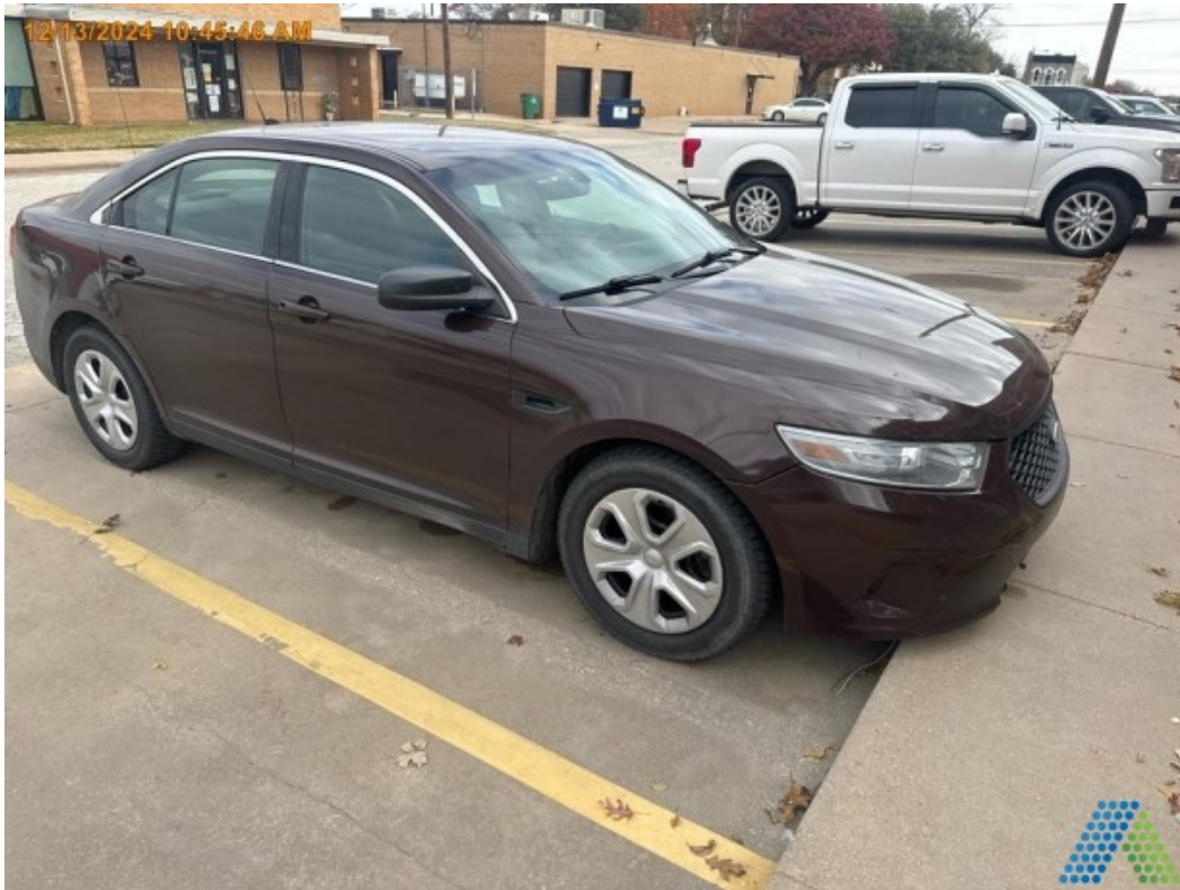
Document Name: RIGHT FRONT.jpg