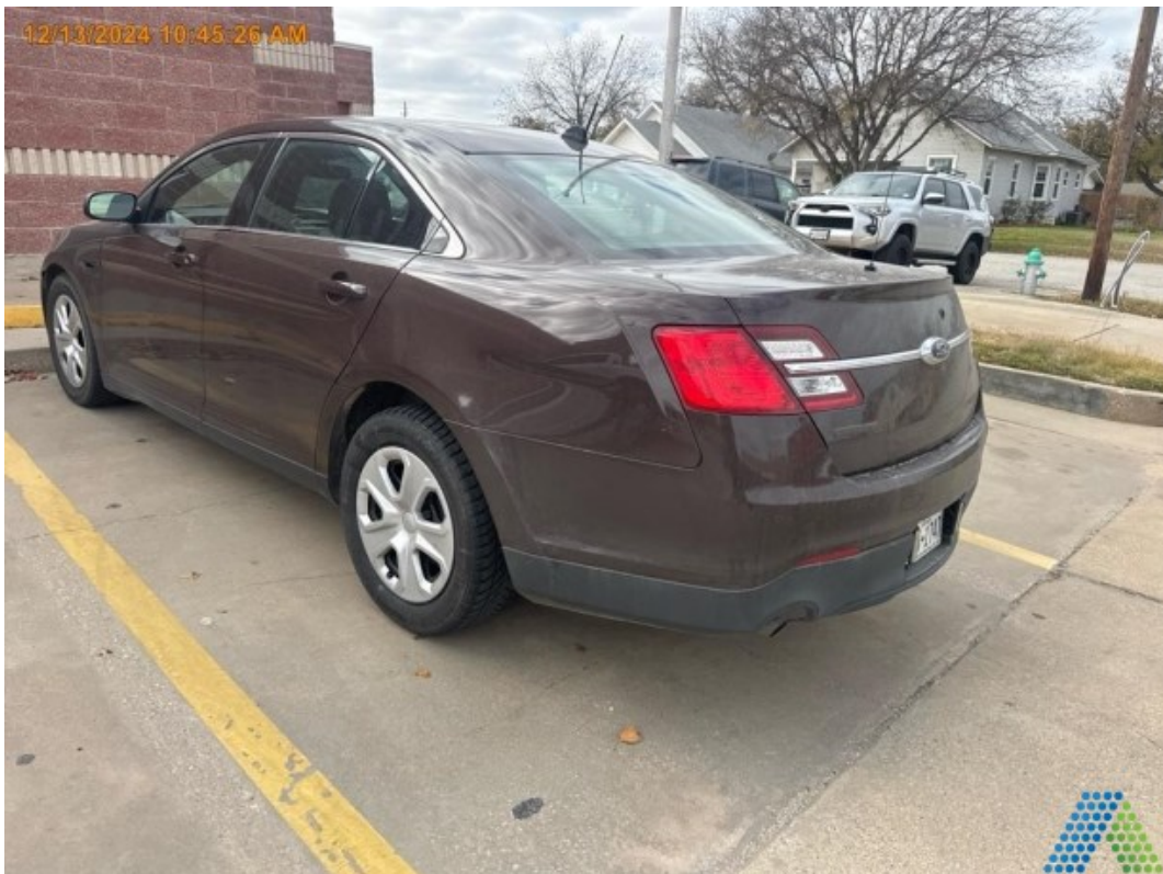
Document Name: LEFT REAR.jpg