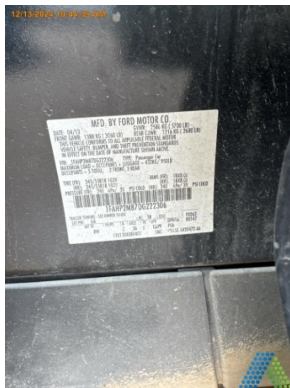
Document Name: VIN DOOR.jpg