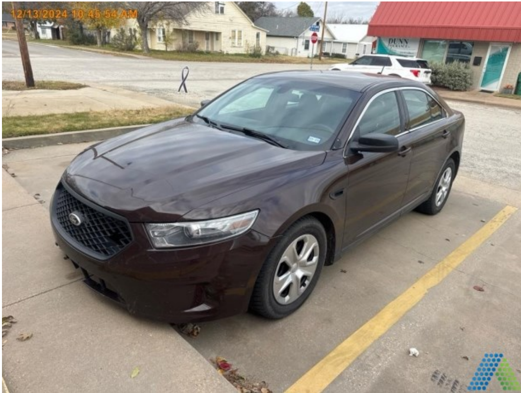
Document Name: LEFT FRONT.jpg