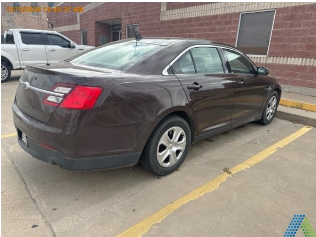
Document Name: RIGHT REAR.jpg