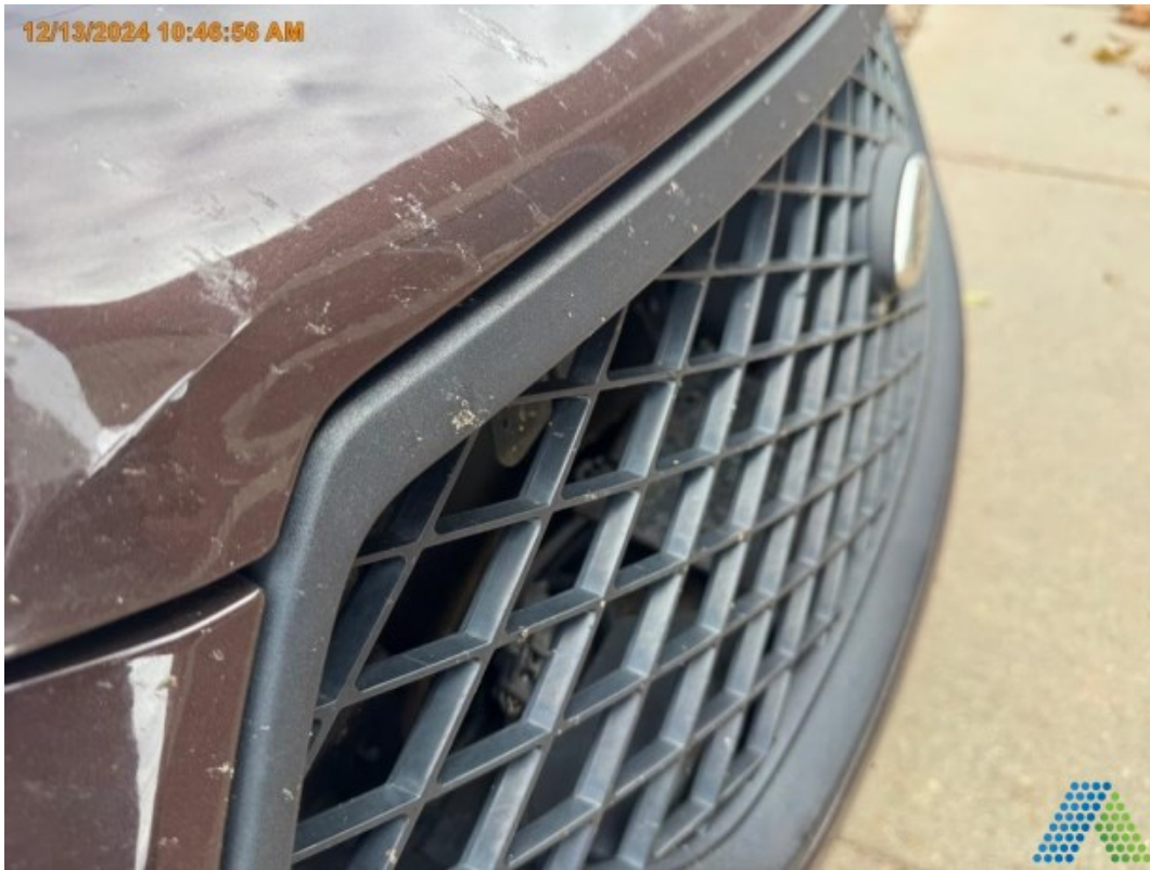
Document Name: Hood.jpg