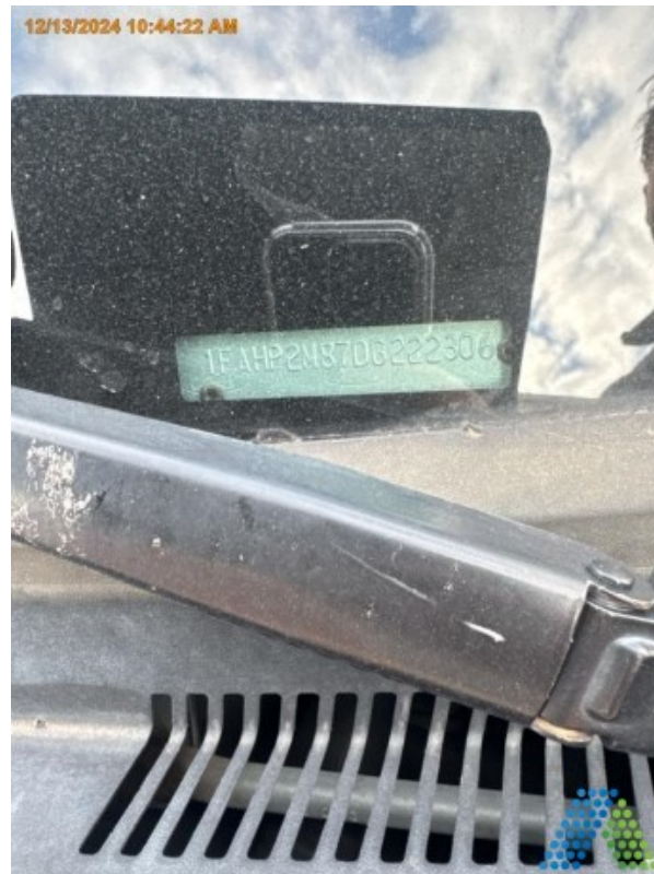
Document Name: VIN DASH.jpg