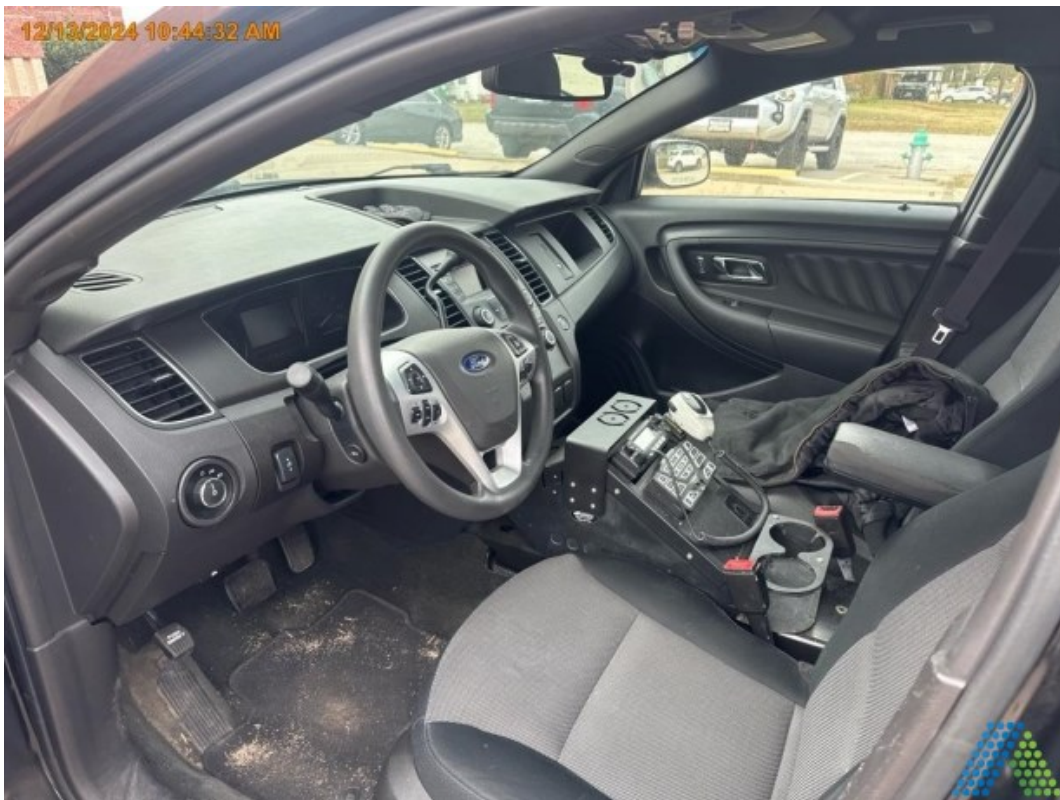
Document Name: INTERIOR.jpg